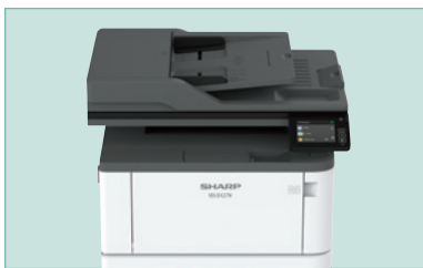
Standard desktop configuration shown.