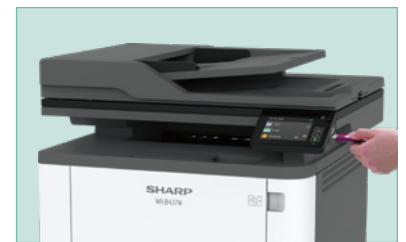
Front USB port for easy direct printing.